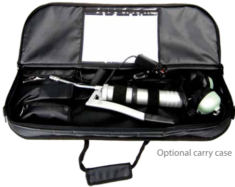
Optional carry case