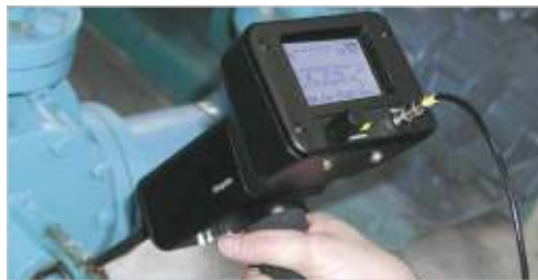
Test/Trend all types of machinery

Ultratone. A unique method that is also employed for heat exchangers is the "Ultratone" method in which a powerful high frequency transmitter floods the shell side of the exchanger with ultrasound. The generated sound will follow the leak path through the tube. A scan of the tube sheet will indicate the leaking tube.